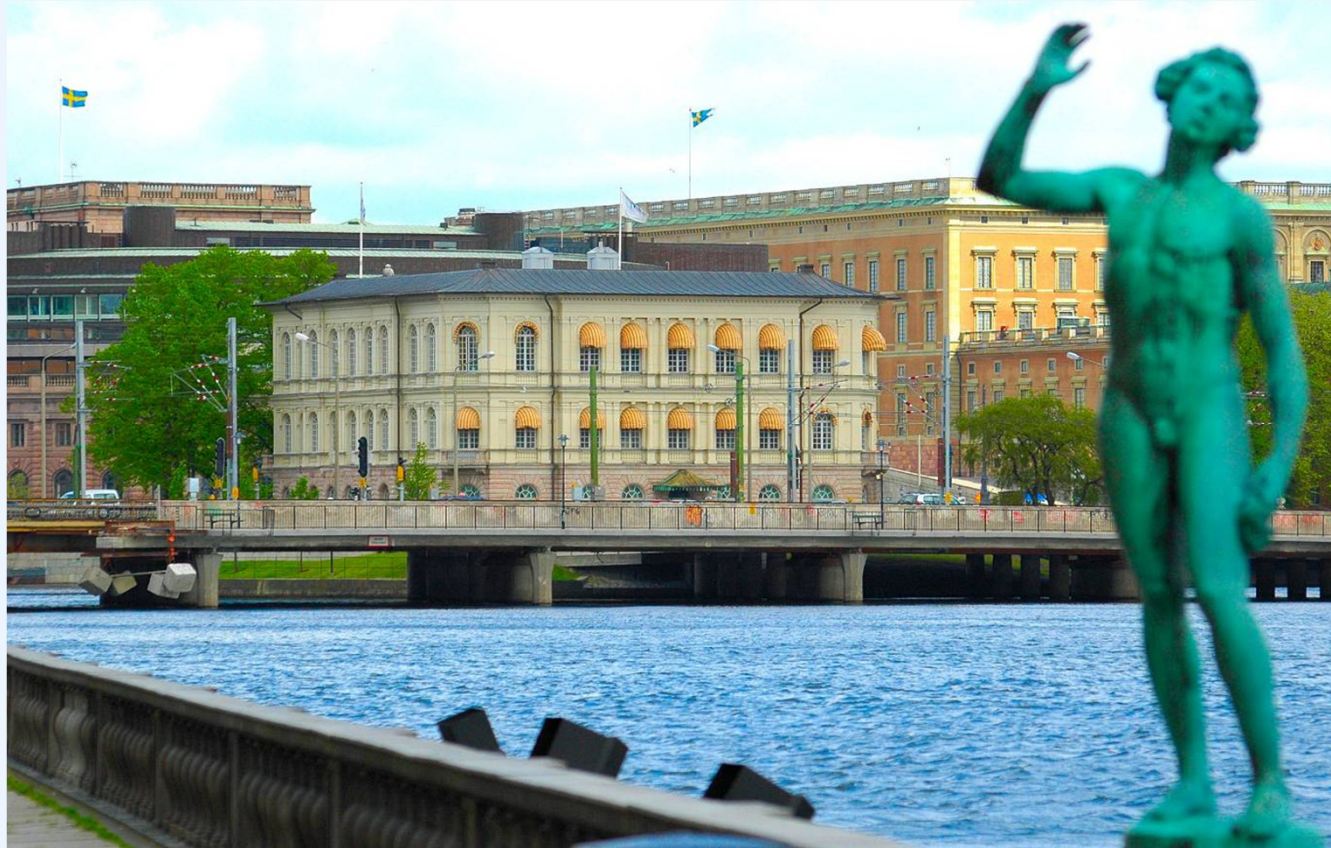
Carl Eldh's beautiful sculpture "Sången" the singer in bronze (paired with a female statue entitled "Dansen")